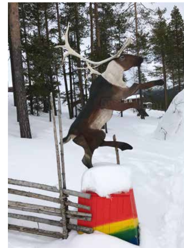
Kids will love the reconstructed Sami Village at Bjornrike slopes, where they can learn about the indigenous Arctic people, see inside a Sami house and meet reindeer.