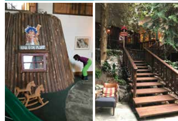
Check out the indoor subtropical forest , pool and spa at Storhogna Högfjällshotell & Spa, a much loved 55-room hotel right on the slopes, with kids' play area.