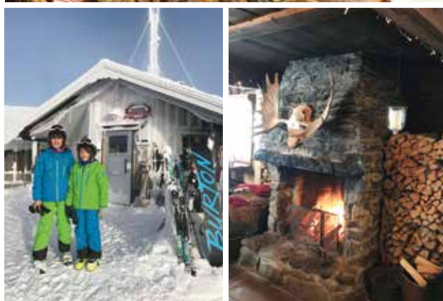
Get in the spirit of fika at Hovdestugan, a log cabin 914m up the mountain with roaring log fire, reindeer antlers on the walls and piles of semla cake and cinnamon rolls.