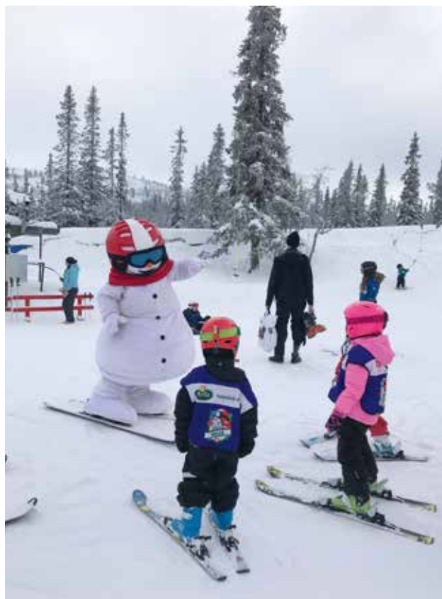
Kids will soon be at home zooming down the slopes when they attend ski school with Vemdalen's SkiStar instructors and Valle, the cuddly 'snowman' in ski helmet and goggles.