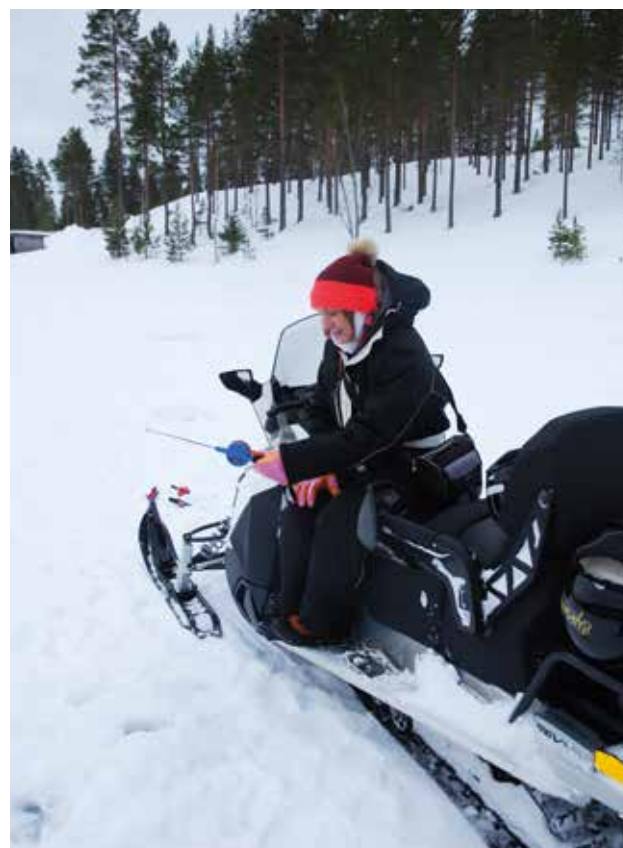
Go snowmobiling and ice fishing with Vemdalen Experience. Enjoy the heated handlebars, chase reindeer herds and drill through a frozen lake to catch an Arctic char.