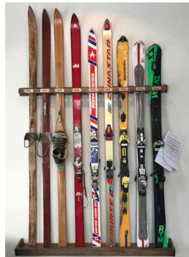
Visit the world's smallest ski museum in Vemdalen's natty tourist office, home to an installation of skis throughout the ages by the artist simply known as 'Local Skier'.